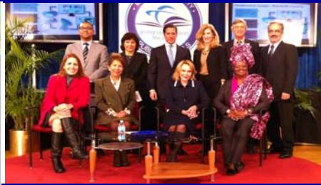
GENERAL OBLIGATION BOND PROJECT TOWN HALL