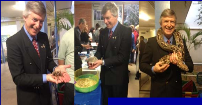
TOWN HALL MEETING & RESOURCE FAIR AT MIAMI PALMETTO SENIOR HIGH SCHOOL