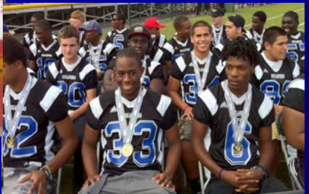
FAIRCHILD GARDENS ENVIRONMENTAL DEBATE