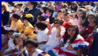
JOSE MARTI PARADE