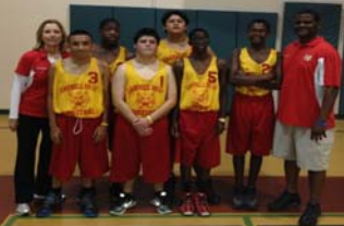
SPECIAL OLYMPIC BASKETBALL TEAM FROM MIAMI PALMETTO SENIOR HIGH SCHOOL WON GOLD AT THE STATE COMPETITION