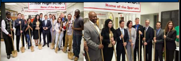
MIAMI SOUTHRIDGE SR. KICKS OFF $6.6M GO BOND PROJECT