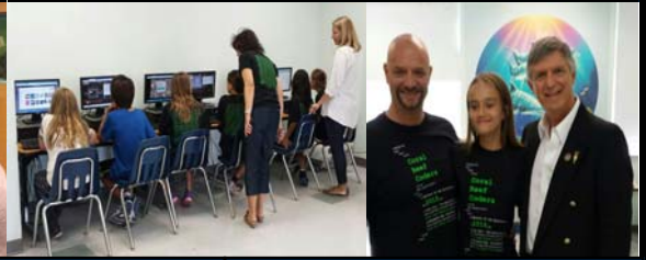
CORAL REEF ELEMENTARY CODING CLUB