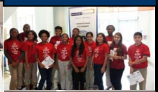
AGRICULTURE DAY AT COCONUT PALM K-8