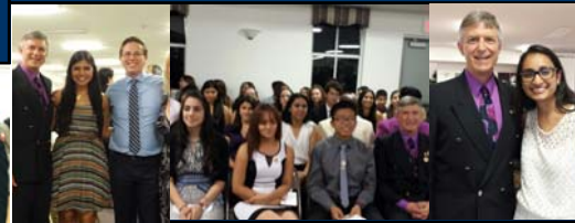
YOUTH FAIR SCHOLARSHIP AWARDS RECIPIENTS