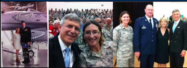
PROMOTION CEREMONY FOR BRIGADIER GENERAL CHRISTIAN FUNK