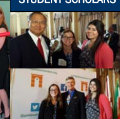
CORAL GABLES CHAMBER RECOGNIZES STUDENT SCHOLARS