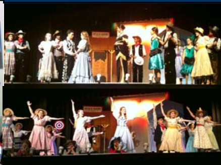
THE MUSICAL COMEDY WHODUNIT CURTAINS AT MIAMI PALMETTO SENIOR HIGH SCHOOL