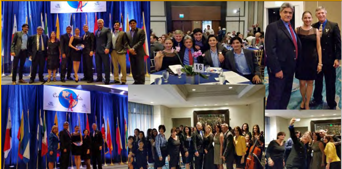
COFFEE 'N CONVERSATION @ WHISPERING PINES EL