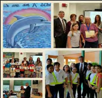
COFFEE 'N CONVERSATION @ WHIGHAM EL