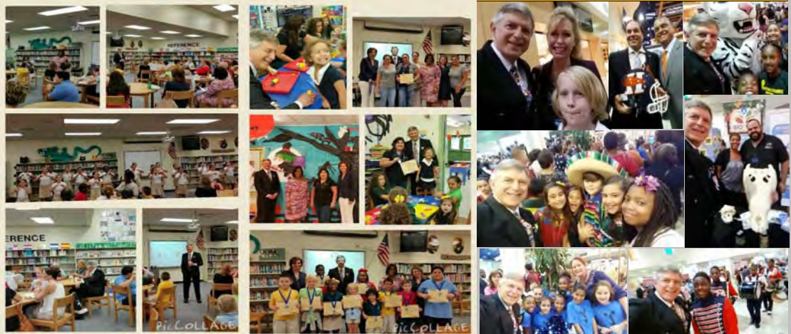
SOUTH REGION EXPO FOR HOMESTEAD, SOUTH DADE, & SOUTHRIDGE