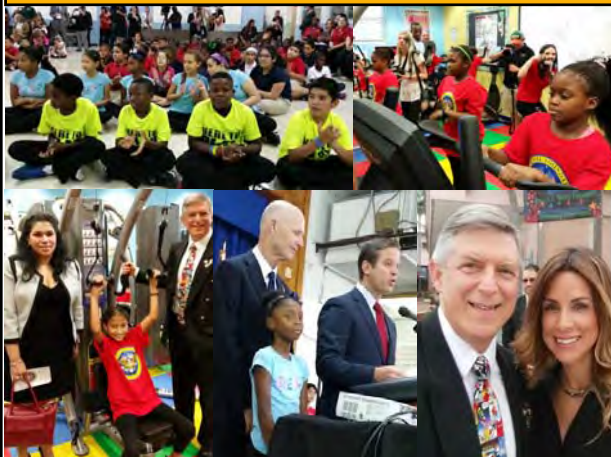
FRANCES S. TUCKER ELEMENTARY LIVE POSITIVELY FITNESS CENTER RIBBON CUTTING CEREMONY