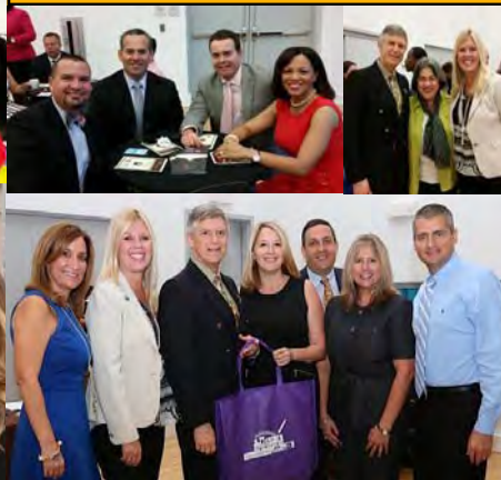
CHAMBER SOUTH EDUCATION & BUSINESS COALITION PRINCIPALS NETWORKING BREAKFAST