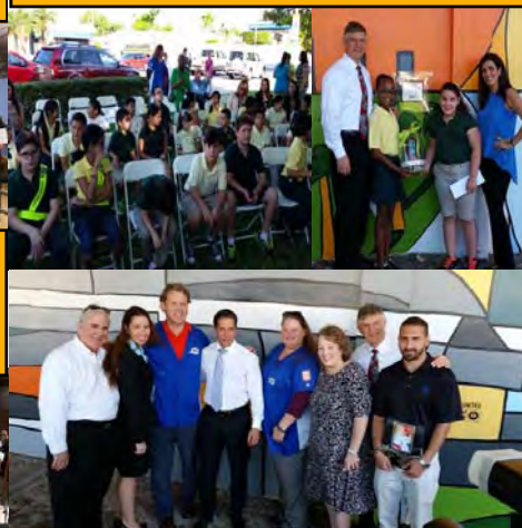
UNITED WAY KICK-OFF & MURAL PROJECT