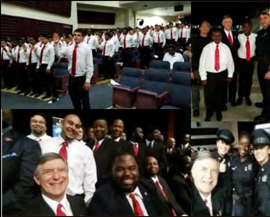
5000 ROLE MODELS OF EXCELLENCE PROJECT REGIONAL SCHOOL TIE TYING CEREMONY @ CORAL REEF SR.