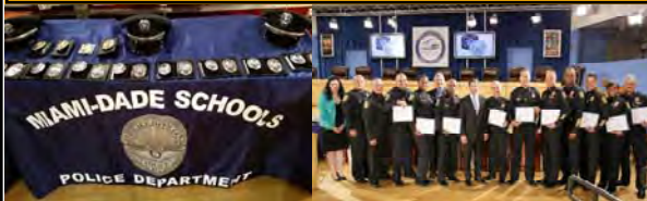
SCHOOL POLICE SWearing IN CEREMONY