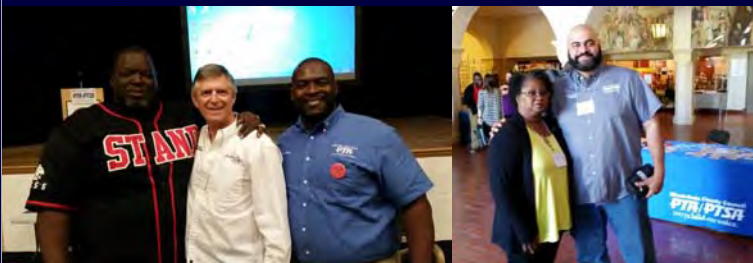
PANTHER MUN II MODEL UNITED NATIONS CLUB @ PALMETTO SR