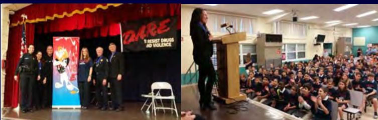
2016 MEN'S SUMMIT & HEALTH AND WELLNESS FAIR @ MIAMI SR. HIGH