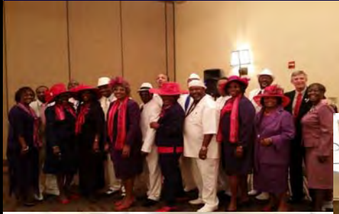
35TH ANNUAL WEST PERRINE DR. MARTIN LUTHER KING, JR., HOLIDAY CELEBRATION UNITY IN THE COMMUNITY BREAKFAST