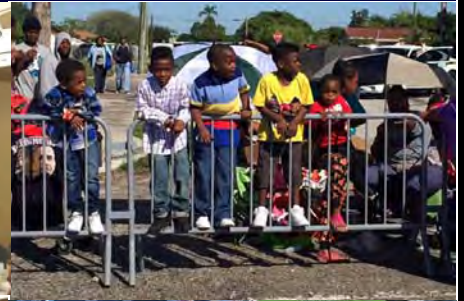
35TH ANNUAL WEST PERRINE DR. MARTIN LUTHER KING, JR., PARADE