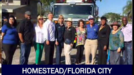
HOMESTEAD/FLORIDA CITY DR. MARTIN LUTHER KING, JR., BREAKFAST