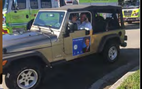
5000 ROLE MODEL DR. MARTIN LUTHER KING, JR., SCHOLARSHIP BREAKFAST