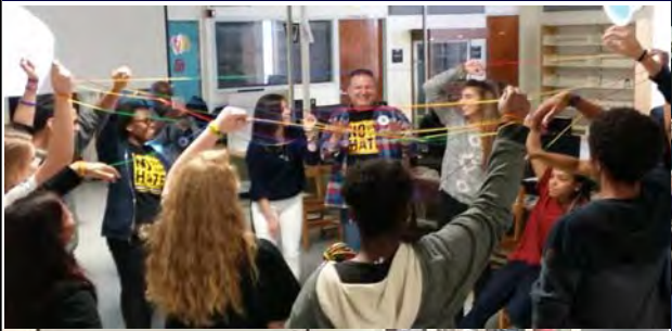
NO PLACE FOR HATE STUDENT PEER TRAINING @ PALMETTO SR