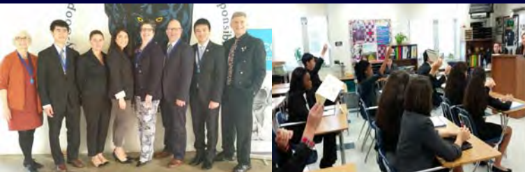
RECOGNIZING NATIONAL MENTORING MONTH AND TAKE STOCK IN CHILDREN @ JANUARY BOARD MEETING