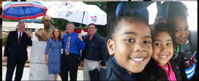
JOSE MARTI PARADE