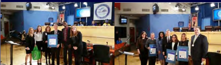
PERRINE ELEMENTARY'S 4TH ANNUAL TOYS FOR TOTS DRIVE COLLECTED OVER 400 TOYS