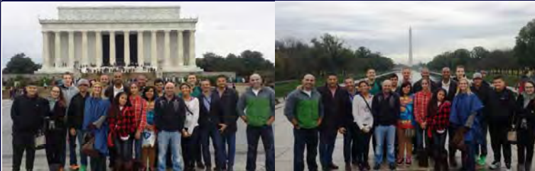
D.A.R.E GRADUATION @ PINECREST ELEMENTARY