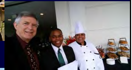
WITH THE MEXICAN AMERICAN COUNCIL ABOARD THE DOCKED CELEBRITY CRUISE SHIP AS THEY RECEIVE A GRANT FROM THEIR CHARITABLE FOUNDATION